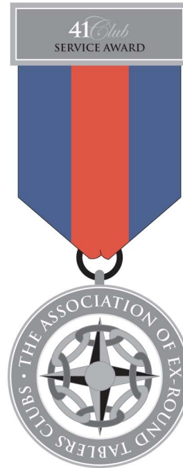
Service Award 41S002

Please note these are artist's impressions.