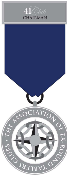
Past Chairman 41C001