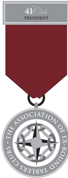
Past President 41C002