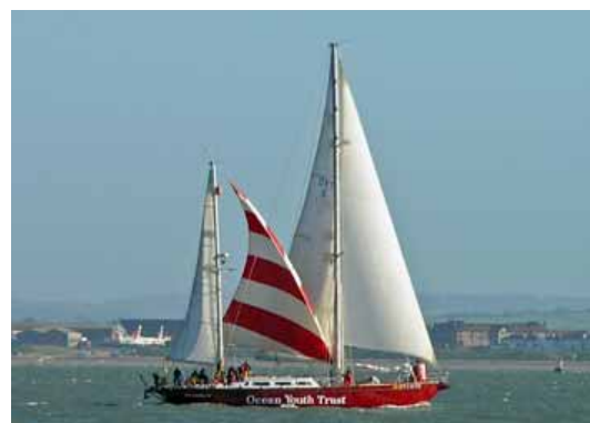
The John Laing under sail

Everyone took loads of photographs and there was also some video taken. The intention is that the video will go on You Tube and we will be exchanging photos via Flickr or some other means. We are all going to become 41 Club Facebook friends, so may be an album on there. OYT now has some very impressed ambassadors who will be promoting OYT around their clubs and areas and encouraging fund raising for OYT.