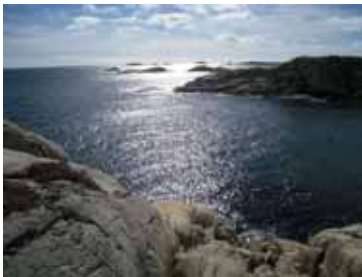
International 41Club 48s Weekend Grimstad, Norway