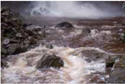
Taken on the Autumn Cottage Weekend in Swaledale

Three views stolen from the Northwich 41 Club photo gallery. All were taken in 2010 on various club activities that members have undertaken. Thanks to Brian Moss and the other intrepid 41ers!