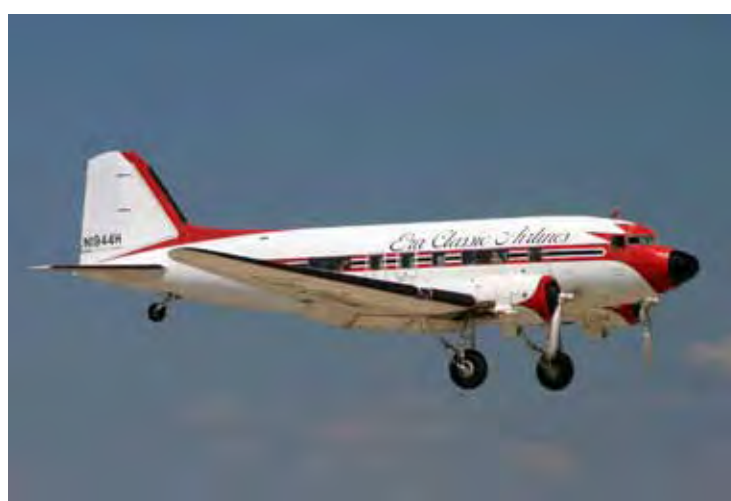
Queen Of The Skies