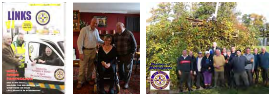
Two of our Presentations & Members building the Annual Bonfire

The main fundraising event was the Annual Fireworks Display and, as ' 41 Club ' had always assisted Round Tble in the running of the event, it was decided that '41 Club' should continue to run this event once Round Table had closed.