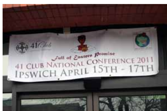
Welcome To Ipswich 2011