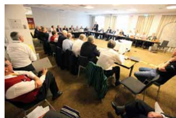
National Council Meeting