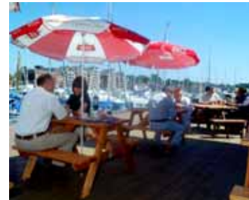
Cruise the Orwell

We are delighted to announce that Ipswich 2011 will be sponsored by: