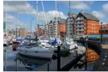
Ipswich has so much to offer Relax