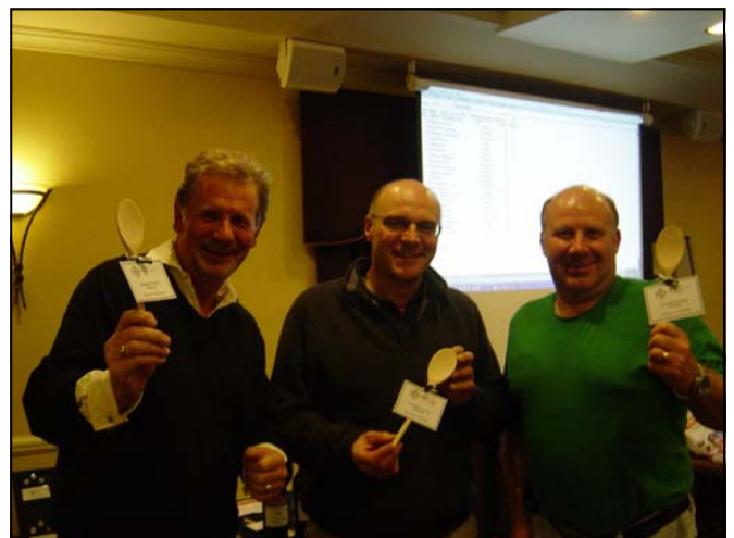
Wooden Spoons—The Late Late Arrivals Thornbury