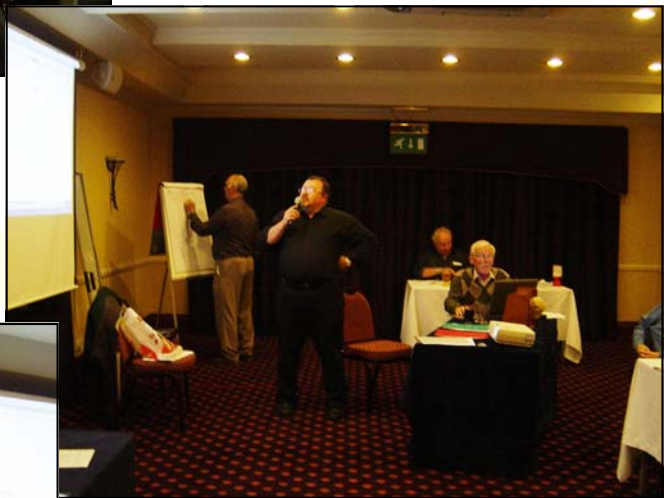
Bristol in charge