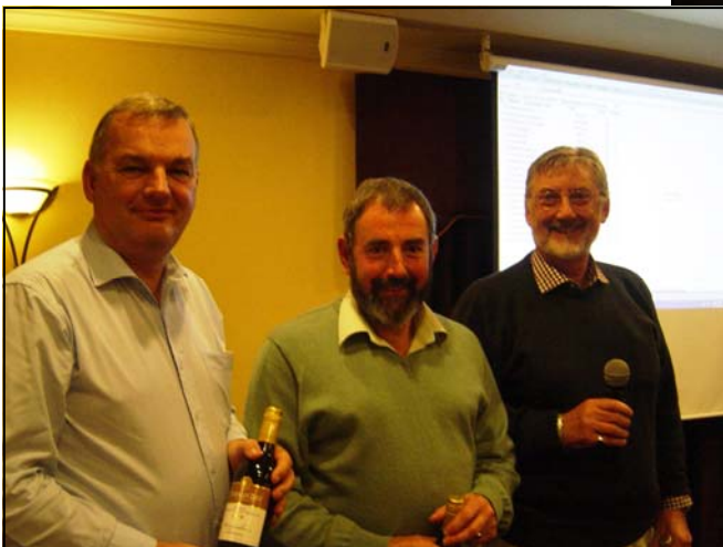
Winners—Weston Wonkers Weston super Mare