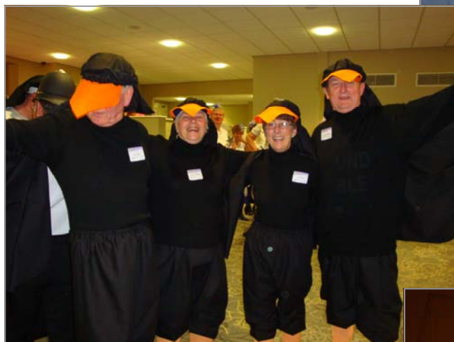
MALVERN HILLS And FOREST OF DEAN