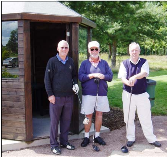
Winners FOREST OF DEAN