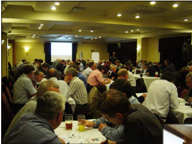
Thinking caps on....

A really super night and thanks to Bristol for their hard work in making the event such a success.