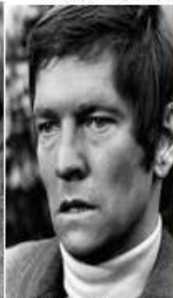
Sir Tom Courtenay