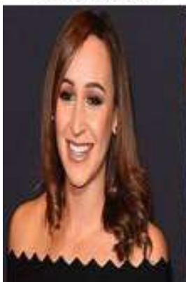
Dame Jessica Ennis-Hill